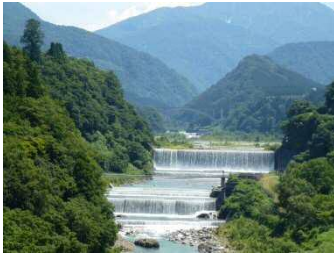
Hongu Sabo Dam ; National Registered Tangible Cultural Properties