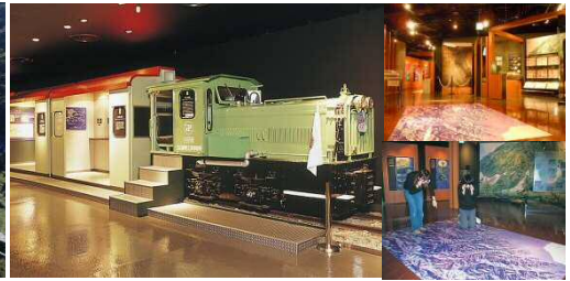
Tateyama Caldera Sabo Museum

We will see the Tateyama Caldera Sabo Museum, which introduces the nature and history of the Tateyama caldera and the sabo works. By observing the Hongu Sabo dam and the Yokoe headwork etc. in the middle of the Joganji River, we will learn about countermeasures against the steep river in Joganji River.