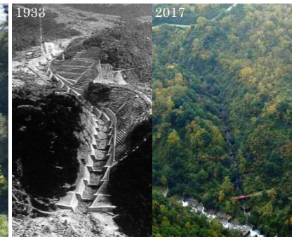
Dorodani Sabo Dam Group Revitalizing the Greens

We will see the Sabo works against sediment-related disasters caused by the earthquake etc. and historical sabo facilities such as Shiraiwa Sabo dam in the Tateyama caldera. We will also board the fantastic Trolley Train that was designated as the Registered Monument by the government carrying the materials for Sabo works. In addition, we will see the Tateyama Caldera Sabo Museum.