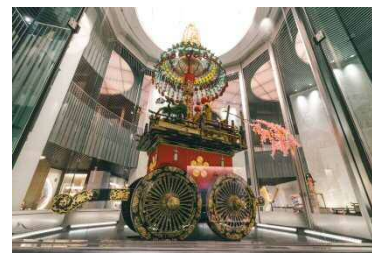
Takaoka Mikurumayama Museum ; Important Tangible and Intangible Folk-Cultural assets of Japan (UNESCO)

We will visit the world heritage "Gokayama Ainokura Gassho-style Village" (steeply-pitched thatched roofs unique to heavy snowy areas) and the national treasure "Zuiryu-ji Temple" (Zen temple architecture of the 1600s) etc. in Toyama.