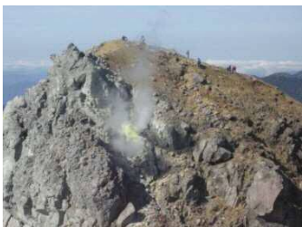
Mt. Yakedake (active volcano)