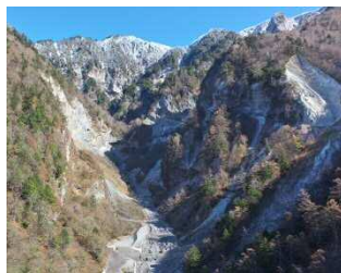
Series of Sabo dams in Shiratani Valley