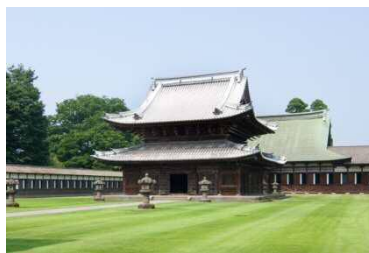
Zuiryu-ji Temple ; National Treasure