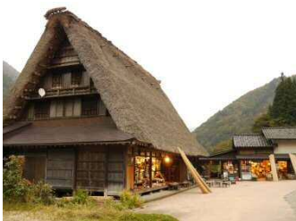
Gokayama Ainokura Gassho-style Village ; World Heritage (UNESCO)