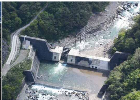
Myo-Jyu Sabo Dam with movable shutters