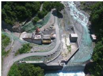
Kuronagi-River No.2 Downstream Sabo Dam (under construction)